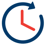
EXTENDED SERVICE LIFE