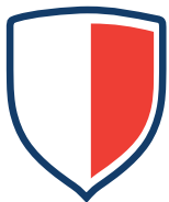
INTERNAL WEAR PROTECTION