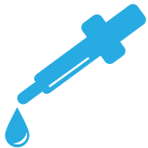
IMPROVED LUBRICATION RETENTION